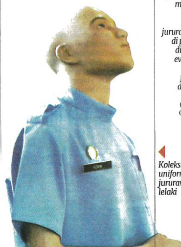
◀ Koleksi uniform jururawat lelaki