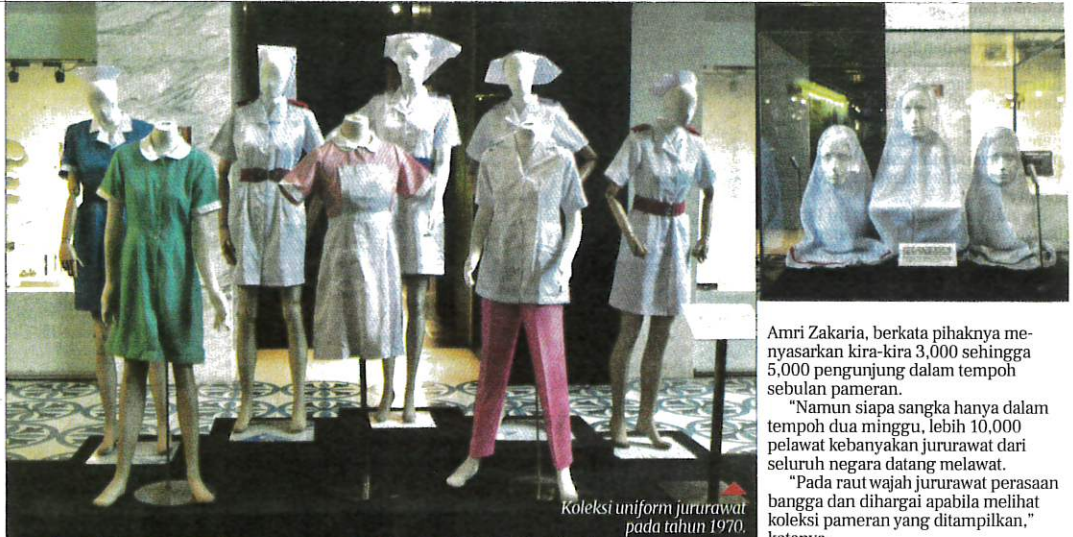
koleksi uniform jururawat pada tahun 1970.

Perubahan mengikut keadaan semasa seperti perubahan perjawatan membabitkan gred, pelantikan jururawat lelaki dalam kejururawatan dan kebenaran memakai pakaian menutup