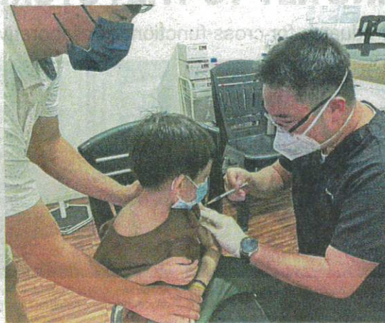
Virus protection: A boy getting his Covid-19 vaccination at a clinic in Penang.

A spokesperson from a clinic in Bayan Lepas said they had not